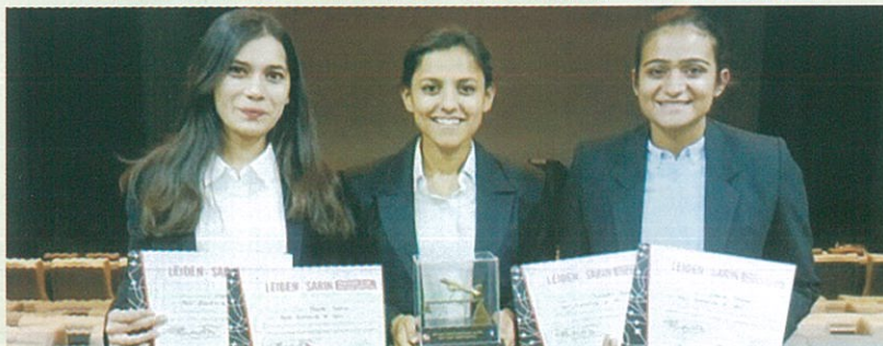
At Seoul, Republic of Korea